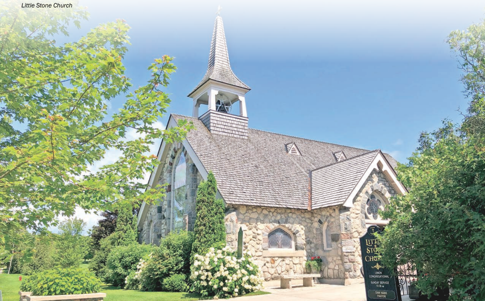
Little Stone Church

$576 | City of Mackinac Island - Recreation to provide Ice Rink Flooring