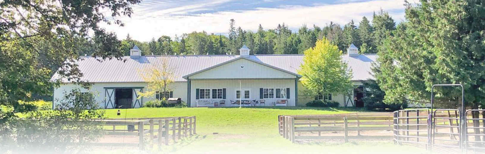
Mackinac Community Equestrian Center

$1,278 | Mackinac State Historic Parks to provide microfilming of the Mackinac Island Town Crier