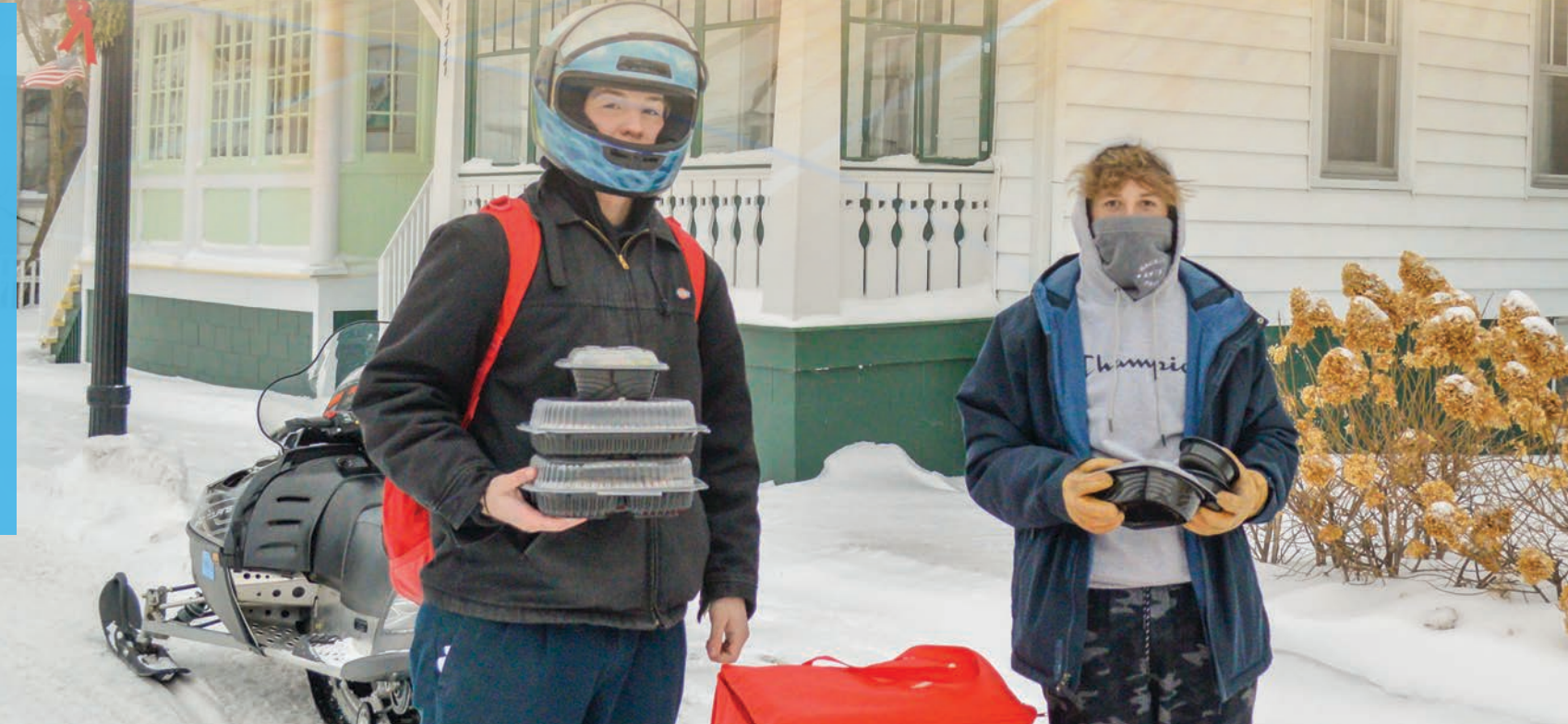
Ste. Anne's Catholic Church: Meals on Snowmobiles