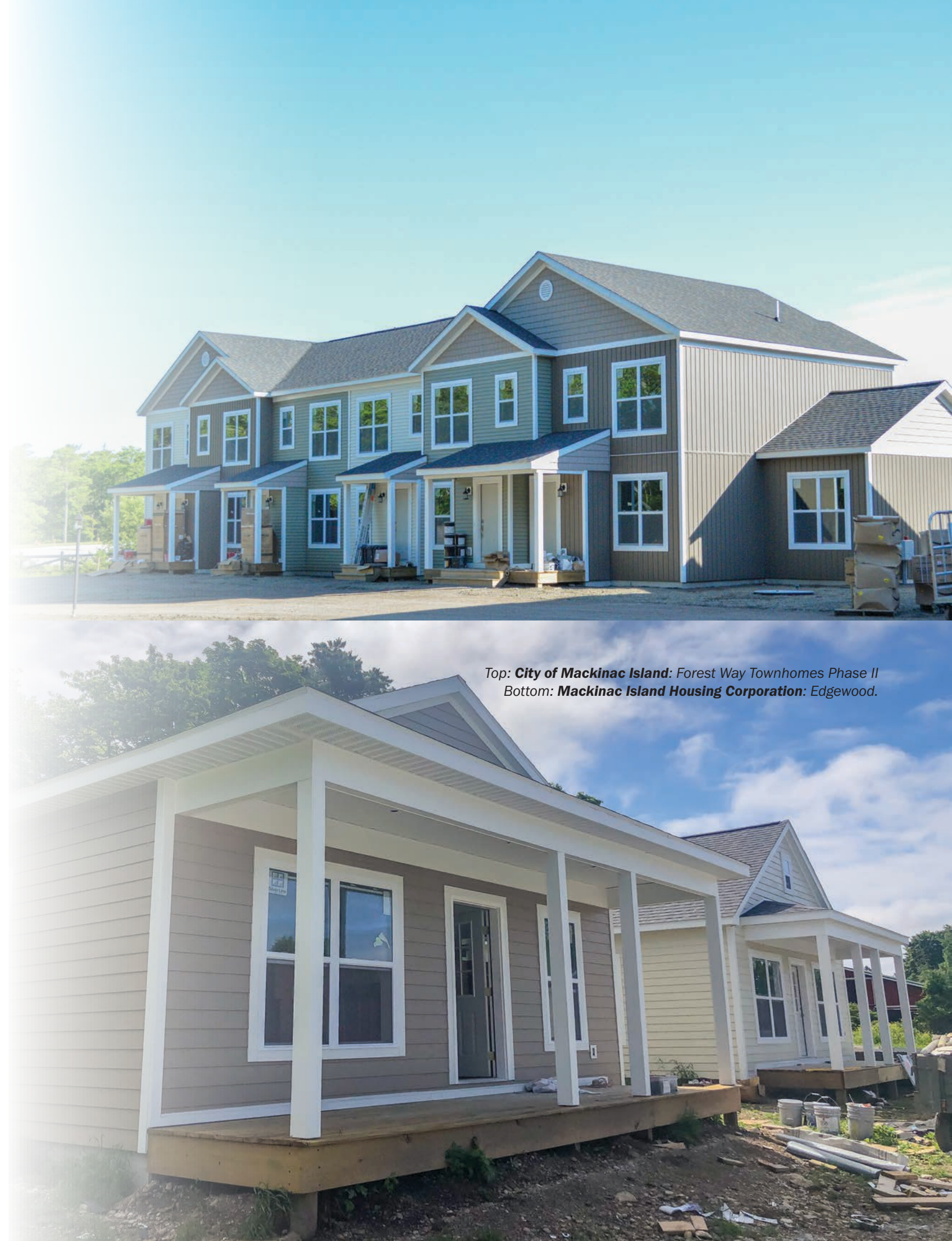
Top: City of Mackinac Island: Forest Way Townhomes Phase II Bottom: Mackinac Island Housing Corporation: Edgewood.

Donate using the enclosed envelope or give securely online at micf.org .