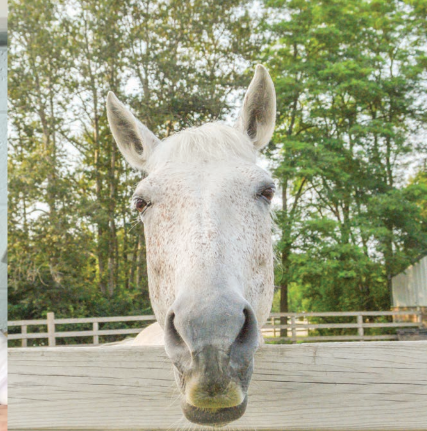
Clockwise, from above: Mackinac Marine Rescue : 2021 Engine Repower and Upgrade; Mackinac Island Public School : Yoga in the Classroom; Mackinac Horsemen's Association : Upper-Level Jumping Horse Ellie; Mackinac Island Recreation Department : Sporties for Shorties Day Camp; Little Stone Church : Phase II Building Restoration Project.